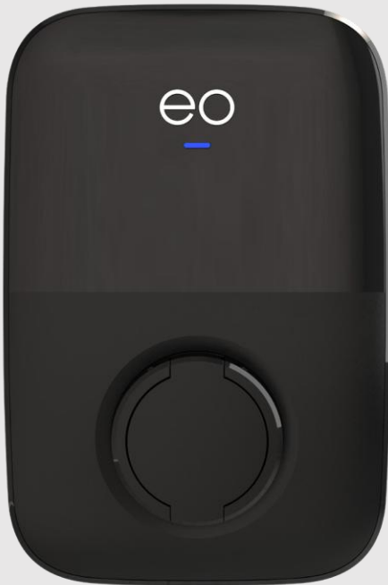
EO GENIUS 2

The charger that makes switching to electric a business advantage.